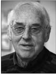
Helmut Hubacher

Courtemaiche (JU, Jura). The security policy was one of the core topics of the former long-standing SP (Socialist Party) Member of the National Council and party president Helmut Hubacher. He is convinced, that Switzerland needs an Air Force, as long as it has an Army. New to the Gripen procurement for him is that the Army does no longer impose measures against the Defense Department.